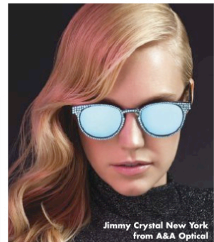
Jimmy Crystal New York from A&A Optical