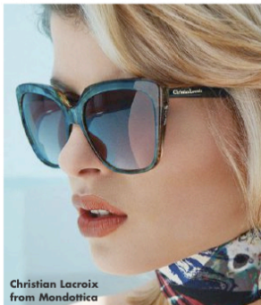
Christian Lacroix from Mondottica